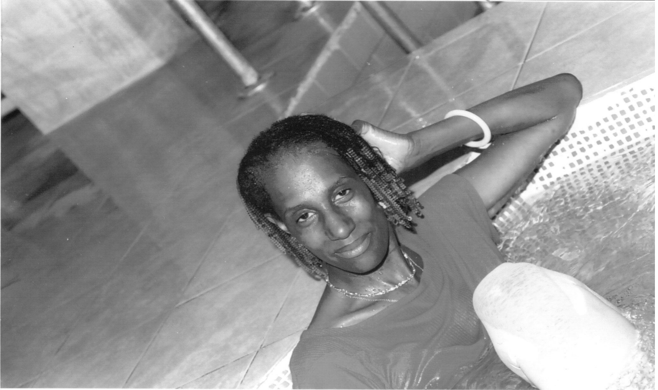
PAMUKKALE TURKEY 2001

Now to all of the people that has walk with me in some part of my journey in life. That has shared in the inspiration that inspired me from our friendship to write these special collections of poems. Beloveds may your path be full of happiness and love. May you'll get everything you want in life. Beloveds ones remember that you share in a part of my life some of these poems came about from our time we spent together each was an experience. In growing we all learn from one another as people, but the most important thing of all is when you can remain friends.