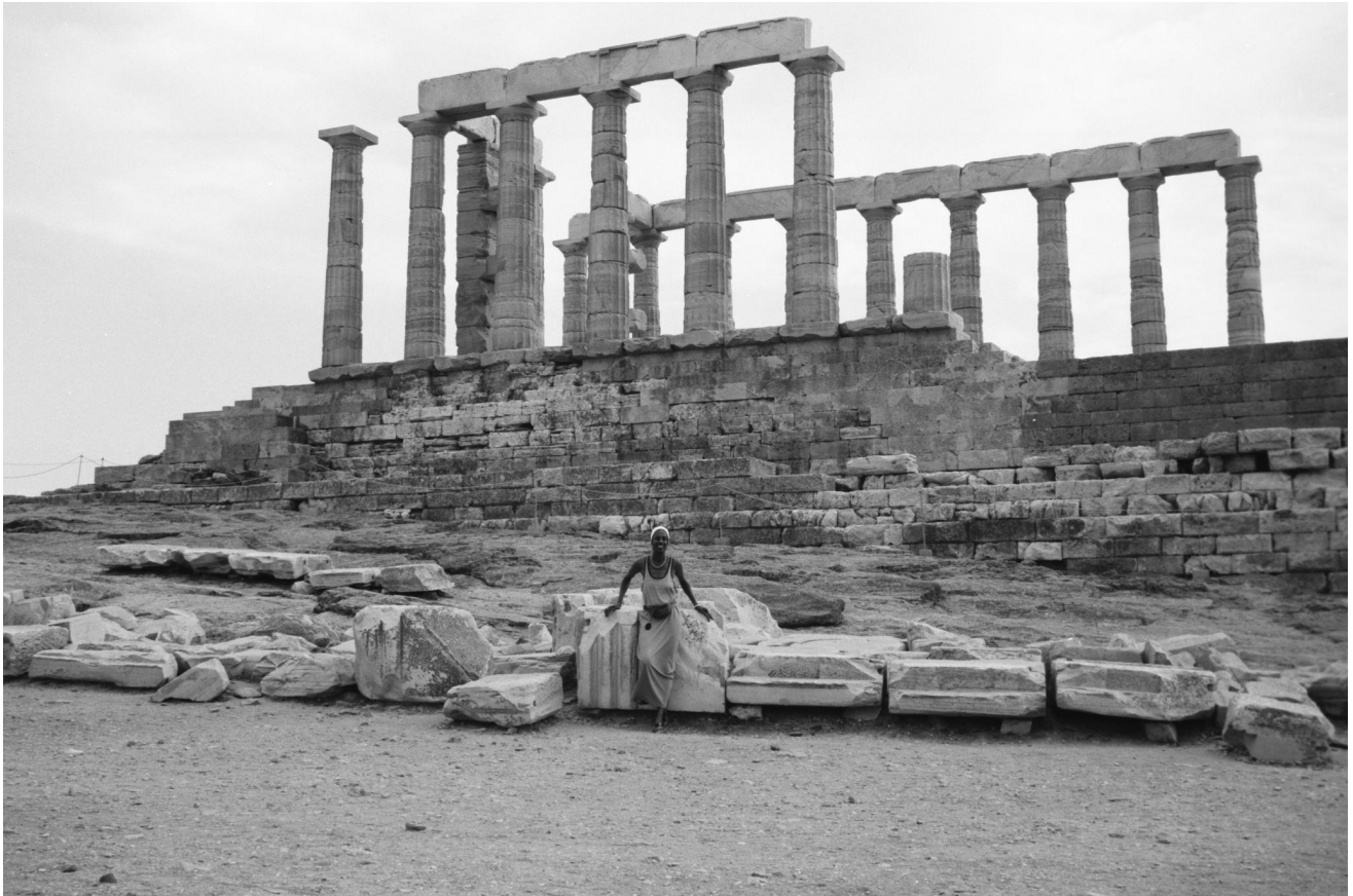
Mount Olympia in Greece