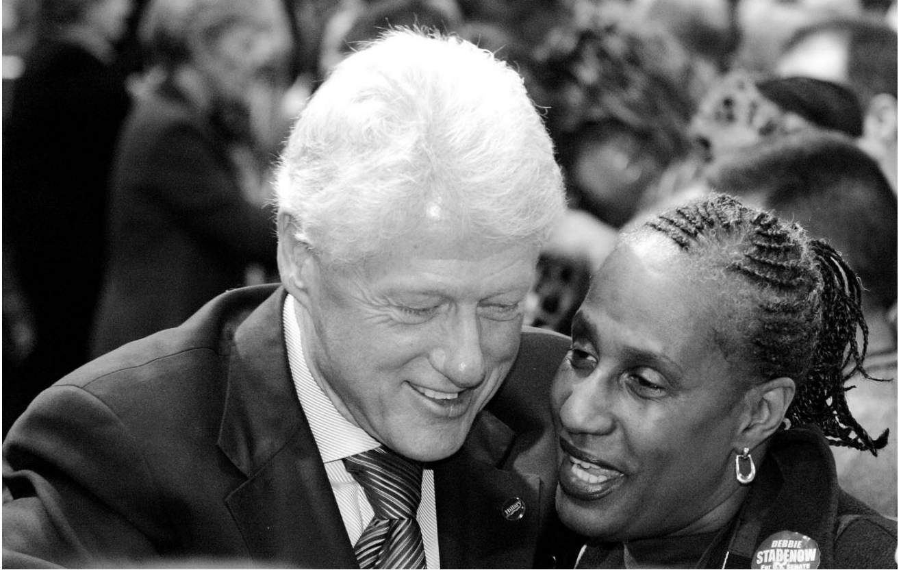
42 nd President Bill Clinton