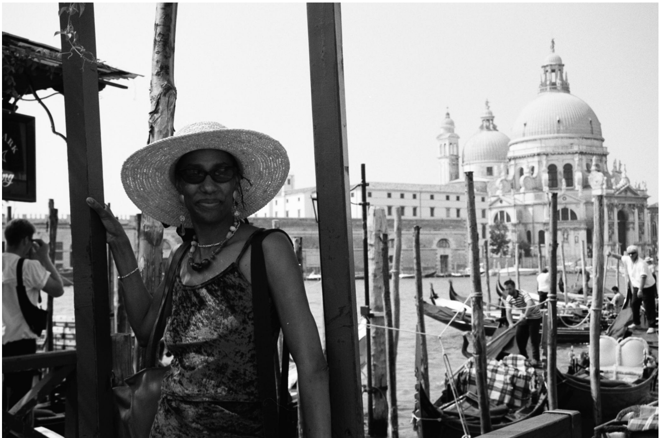
Water City Venice